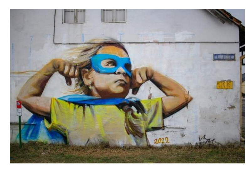
Fig. 6. Hero girl, Kędzierzyn-Koźle