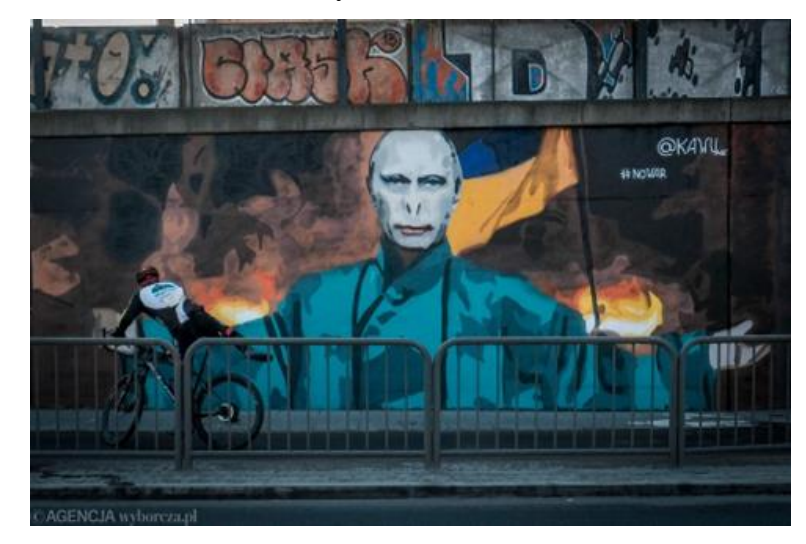
Fig. 4. W. Putin as Lord Voldemort, Kawu